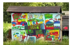
Marra Farm is among the top three community programs that survey respondents indicated they use in South Park. (survey question 19)