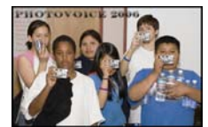
84% of survey respondents say they feel like part of the South Park community. They named positive relationships with their neighbors as the number one reason why they feel like a part of the community. (survey questions 4, 4a, 6)