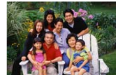
40% of survey respondents do not know what programs in South Park are available for the entire family. (survey question 18)