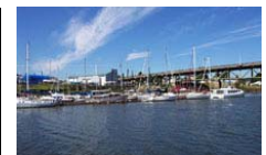
The Duwamish River was noted by many respondents as something they like about South Park. (survey question 7)