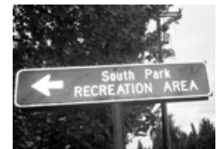
Parks and open spaces were most frequently listed as “Very Important” to making a neighborhood youth- friendly (survey question 14)