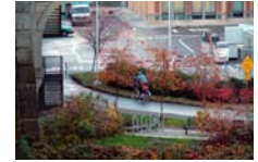
30% of survey respondents travel within South Park either on a bicycle or on foot. (survey question 8)

*Items 2.2f and 2.2g could be part of joint project.