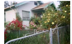
Location and affordability are the top two reasons why South Park survey respondents have chosen to live in South Park. (survey question 3)