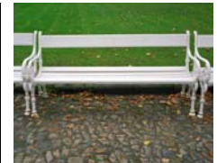
43% of survey respondents would prefer that Terminal 117 be converted to a park or open space. (survey question 28A)