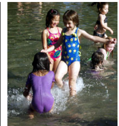
36% of survey respondents listed lack of information and communication as the number one reason for not knowing what programs are available for their children. (survey question 15b)