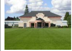
The South Park Community Center was the most frequently identified youth and community program provider in South Park. (Survey questions 15A, 16A, 19)